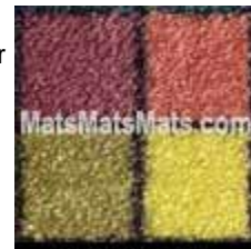
High Quality Solution Dyed Fibers