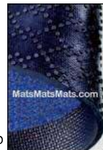
Skid Resistant Backing

Flammability: Meets or exceeds FMVSS-302 (FEDERAL MOTOR VEHICLE SAFETY FLAMMABILITY STANDARD 302). Meets or exceeds CPSC FF170 (Consumer Products Safety Commission Flammability Test).