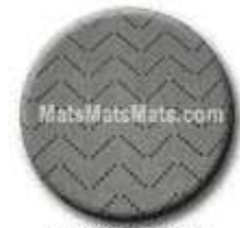
Light Gripper Rubber Backing