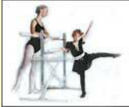
Free Standing Ballet Bars