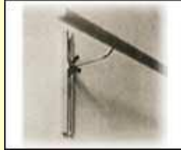
Wall Mounted Ballet Barre