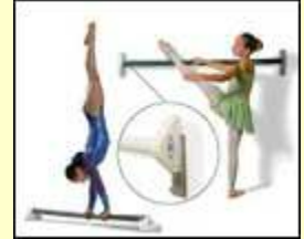
Wall or Floor Mount Multi-Use Bar