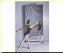
Mylar Dance Mirror