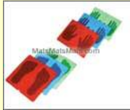
Hand and Foot Positioning Mats